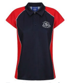
Eco House Polo