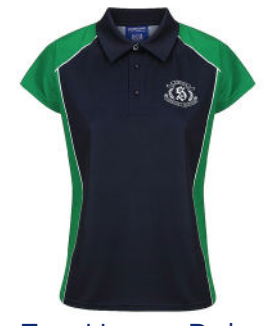
Eco House Polo Findlay