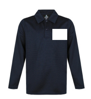
Long sleeve Polo On order - Coming soon