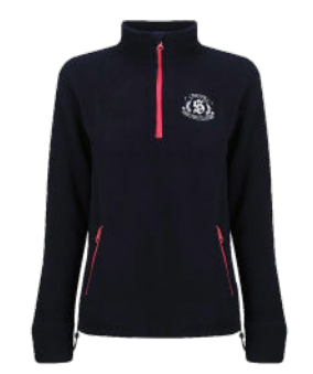
Eco Polar Fleece* Prep - Year 4 only