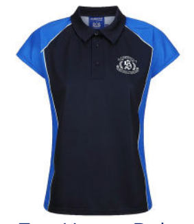
Eco House Polo Arnold