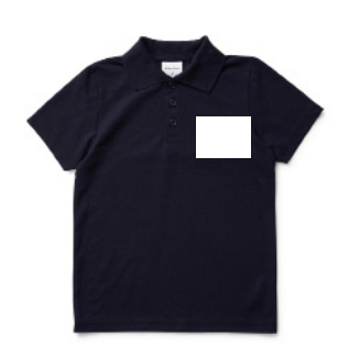
Polo On order - Coming soon