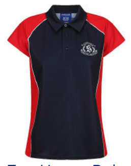
Eco House Polo Grenfell