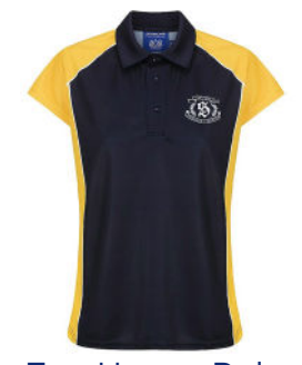
Eco House Polo Gilbert