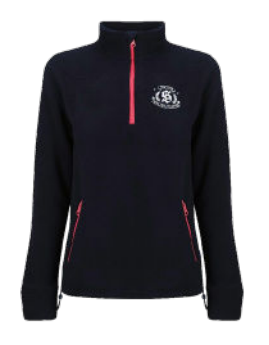
Eco Polar Fleece