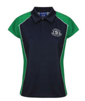
Eco House Polo Findlay